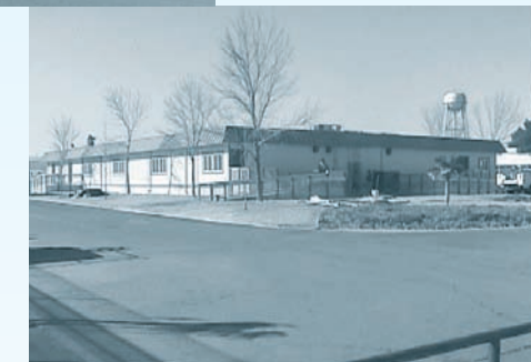
Newly constructed EOIR courts building (Above).